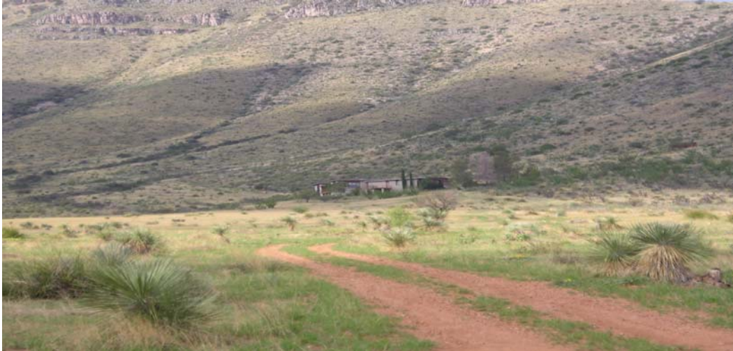
Highway 82, Elgin Arizona