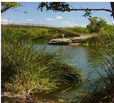
Lake Patagonia wildlife!

Don't fight crowds! Invest in this spacious exceptional parcel of vacant land located in the beautiful community of Lake Patagonia Ranch Estates. Close to lake for year round outdoor activities in private setting with inspiring mountain views in all directions. Great horse/vacation or investment property! Offered at $475,000